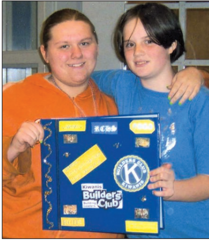
Members of the Randolph County Builders Club won second place in the International Scrapbook Competition.

Other Builders Clubs should start compiling their scrapbook information now for next year's contest. The winning entries are seen by visiting dignitaries and every other visitor to Kiwanis International in Indianapolis before they are returned. What an honor for the Alabama District, Randolph County and the Wedowee Kiwanians.