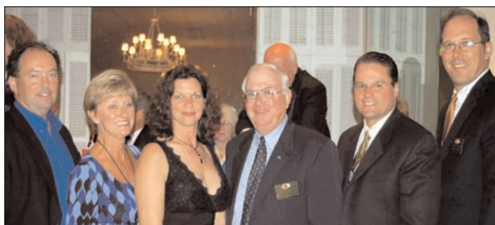
Some of the lieutenant governors installed during Governor's Banquet in Gadsden.